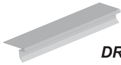
DRIP EDGE cont.

RAINWARE RAINWARE ACCESSORIES METAL ROOFING PRODUCTS FLAT SHEETS MECHANICAL SEAMED PANEL METAL SIDING METAL ACCESSORIES AND FLASHING VENTILATION TRIM COIL, SOFFIT, FASCIA AND ACCESSORIES CUSTOM FABRICATION